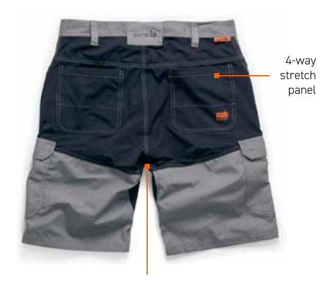
4-way stretch gusset for flexibilty