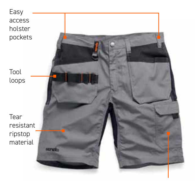
Side pocket with internal phone pocket